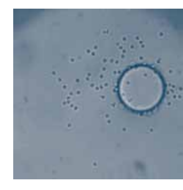
after adding D-biotin: target cells are released from the matrix